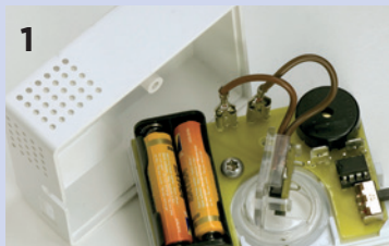
1 Insert 2 standard 1.5V batteries (not supplied) into the unit.