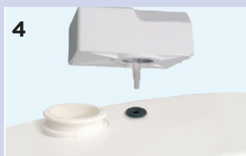
4 Attach the Sanialarm inside the opening of the tube.