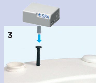
3 Coat with silicone grease before inserting the pressure switch tube of the Sanialarm.