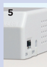
5 Switch to the ON position.

BEFORE HANDLING: DISCONNECT THE POWER SUPPLY FROM THE SANITOILET